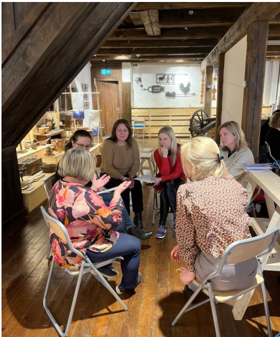
Project meeting in Gdansk

During 2024, we have seen increased interest at local and national level for the museum's international activities. Among other things, we can mention a teacher training course for Estonian teachers that was arranged in April, a study visit by Zambian female mayors through an international mentoring program with Swedish female politicians, and a Ukrainian delegation from Poltava that investigated the conditions for an upcoming twin city exchange with Kalmar municipality. Staff from the Kalmar County museum have also participated in, and presented at, a regional meeting on "Culture's role for sustainable development - Cooperation in the Baltic Sea region" which was arranged in Emmaboda and the inspiration meeting "Transnational cooperation for strengthened competence supply and inclusive labor market" held in our neighbouring region Kronoberg.