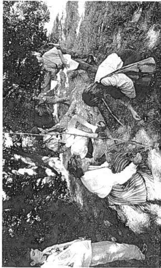
“Saturday at Pastariņš museum”. Latvia. 2006