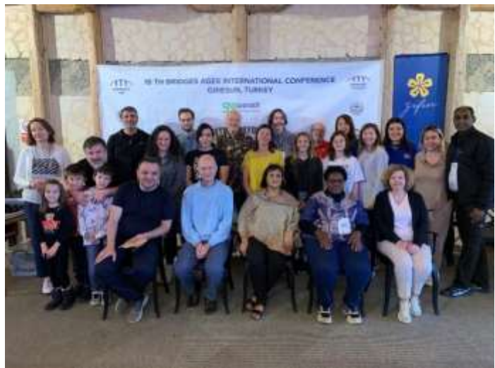
Bridging Ages Board members, keynote speakers, Bridging Ages Turkey coordinating committee and participants from Rhodes, Greece

The hospitality from the Turkish hosts was incredible, all of this was on a volunteer basis. The commitment and efficiency of those who planned this conference were fantastic, including translation into English and arranging transportation for each delegate. The conference venue, the Zifin hotel had panoramic mountain views. Every presentation was aligned with the Time Travel method as a means to address present and future challenges.