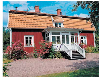
Näs, the first home of Astrid Lindgren

The symposium is arranged by Kalmar County Museum and the Vimmerby Academy and will be held in Vimmerby, 150 kilometres north of Kalmar. Vimmerby is the hometown of Astrid Lindgren, the renowned Swedish author of the Pippi Longstocking books and other works. In the spirit of Astrid Lindgren the keywords for the community are courage, responsibility and imagination. These universal human values are important for all people, schools, museums and society. November 14 th was Astrid Lindgren's birthday.