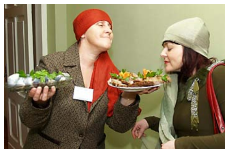
Delicious food in the Time Travel to 1928 at the Durbe Manor