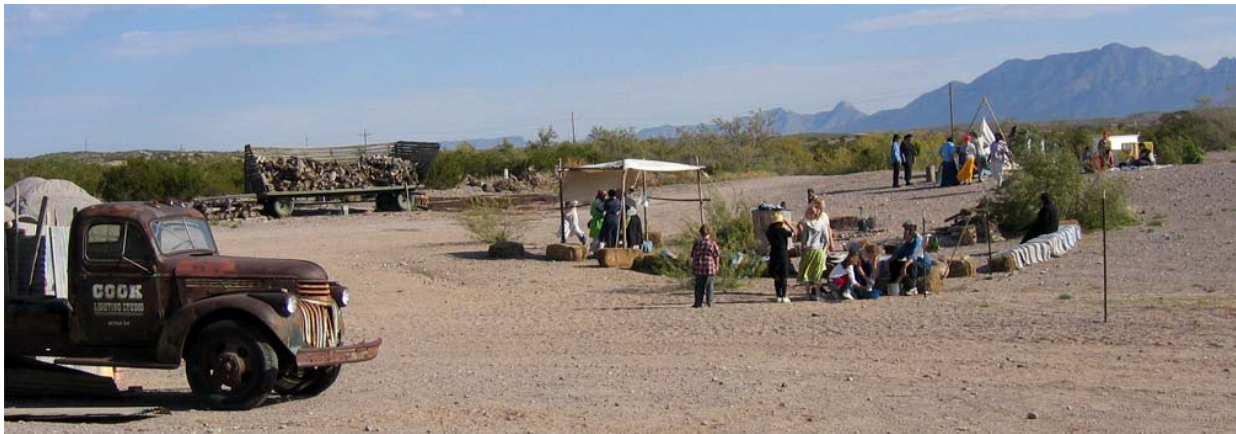
Time Travel to the Great Depression in New Mexico 1937.